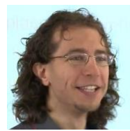
Cesco Reale AS