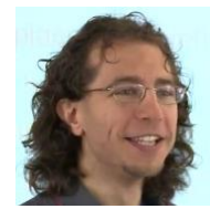
Cesco Reale AS